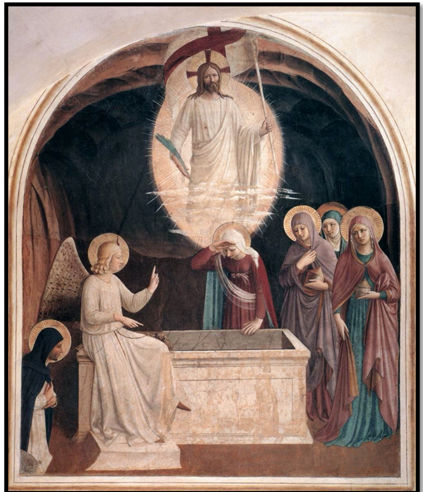
“Resurrection of Christ and Women at the Tomb.” Fra Angelico. 1440-42

Not only us, but Christ Himself – He has been waiting for you – because He loves you!! He wants your love in return! He wants you to have an encounter with Him that will change EVERYTHING in your life! Continued on next page